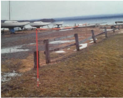
Wooden fencing to be replaced with 5' black chain link fencing.

The $27,685 cost of the new playground equipment, installed by Playground Medic of Hawthorne, NY, will be paid for from the Village's Recreation Trust Fund. Money in this fund comes from a recreation fee imposed on new subdivisions which do not provide a recreation component.